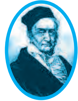
Carl Friedrich Gauss (1777 – 1855)

Carl Friedrich Gauss is often referred to as the 'Prince of Mathematicians' and is considered one of the three greatest mathematicians of all time, along with Archimedes and Newton. He has made fundamental contributions to both mathematics and science.