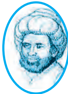
Muhammad ibn Musa al-Khwarizmi (C.E. 780 – 850)

A lemma is a proven statement used for proving another statement.