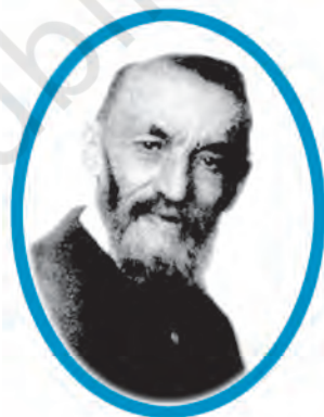
G. Peano (1858-1932)

In contrast to deduction, inductive reasoning depends on working with each case, and developing a conjecture by observing incidences till we have observed each and every case. It is frequently used in mathematics and is a key aspect of scientific reasoning, where collecting and analysing data is the norm. Thus, in simple language, we can say the word induction means the generalisation from particular cases or facts.